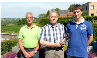
1 HENSEN-MENTIOR 12240pts.