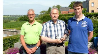
1 HENSEN-MENTIOR 14850pts.