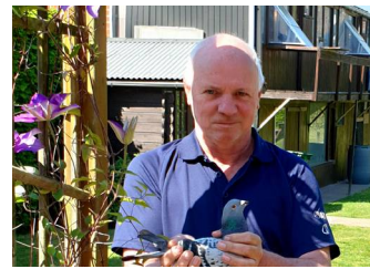
1 DENIES Rudy 19345pts**