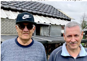
2 SCHROYEN -STOCKMANS 11285pts**