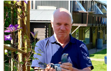
2 DENIES Rudy 26645pts.