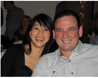
1 DEHON-DEMONSEAU 19200pts**