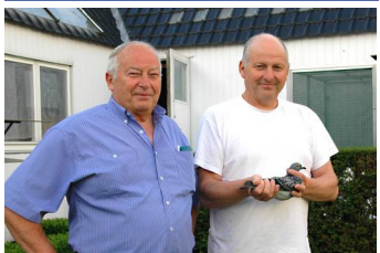
1 VANDENHEEDE Gebr. 9560pts**