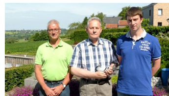
1 HENSEN-MENTIOR 14850pts**