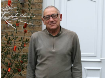
1 MUREZ-MARICHAL 32155pts**